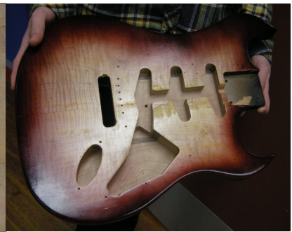
The various stages of guitar building!